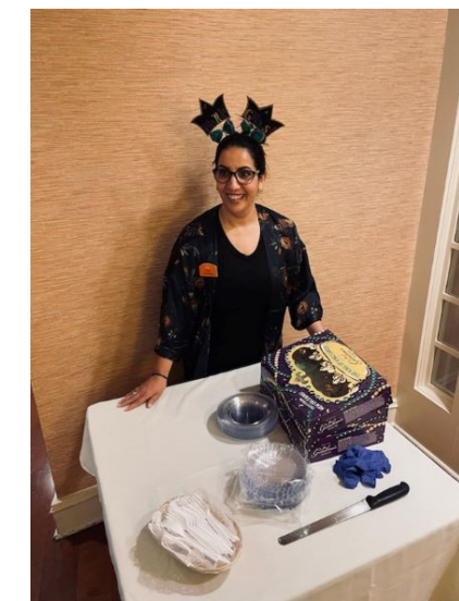
Mardi Gras Cake